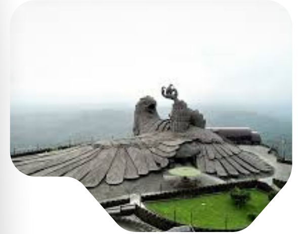
Jatayu Earth's Center