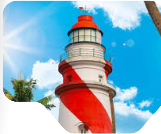
Thangassery Light House